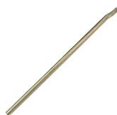
ST4004461 Long Tire Lever