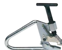
EAA0329G10A Clamp for Steel Wheels