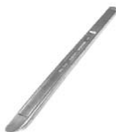
EAA0247G02A Tire Lever