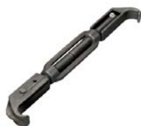
EAA0329G13A OTR Extension for Split- Ring Wheels