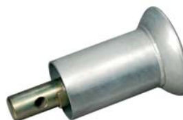
EAA0329G11A Mounting Roll for Tubeless Tires