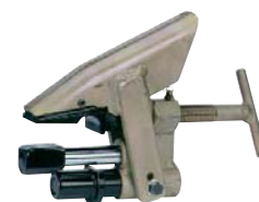
EAA0329G05A Clamp for Alloy Wheels