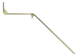
ST4002354 Bead Pushing Lever