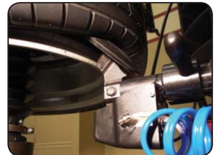
Locking disc position is quick and accurate on both sides of tire.