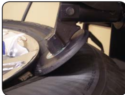
Polymer disc won't damage wheels or tire sensors.